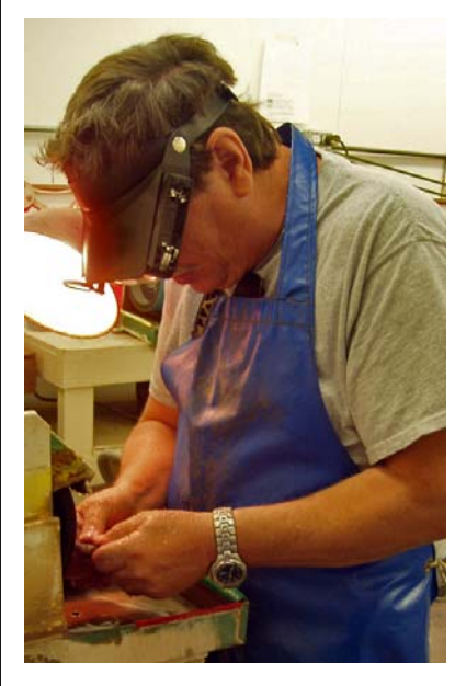
Even our President is getting in some cabbing time.