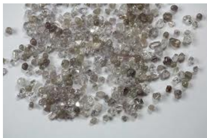
Unsorted rough diamond crystals

Diamond occurs as scattered crystals in kimberlites, which are ultrabasic rocks having their origin in the upper parts of the Earth's mantle. At this depth, the pressures and temperatures are suitable for the crystallization of diamonds. It is also found in secondary deposits in sediments formed by the erosion of primary diamond-bearing rocks. In these deposits diamonds have survived the processes of weathering and transport owing to their great hardness and chemical resistance. The diamonds are usually concentrated in certain beds because of their relatively high density. Most natural diamonds come from such occurrences.