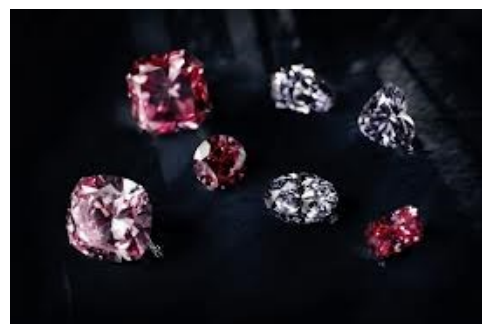
Exceptional natural-colored diamond group

Diamond occurs as scattered crystals in kimberlites, which are ultrabasic rocks having their origin in the upper parts of the Earth's mantle. At this depth, the pressures and temperatures are suitable for the crystallization of diamonds. It is also found in secondary deposits in sediments formed by the erosion of primary diamond-bearing rocks. In these deposits diamonds have survived the processes of weathering and transport owing to their great hardness and chemical resistance. The diamonds are usually concentrated in certain beds because of their relatively high density. Most natural diamonds come from such occurrences.