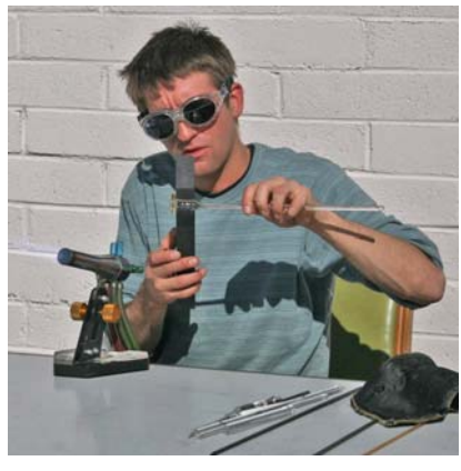
Shaping the glass

Adding the "petals" of the soon-to-be flower