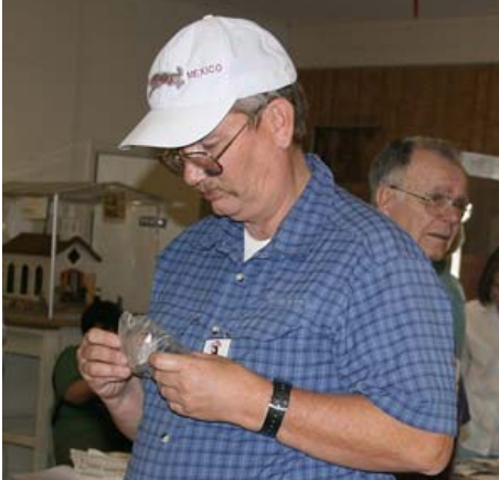
And this is the guy whose hard work over the past year made the Silent Auction a huge success.

It got a little crowed around the tables at times but the bidders did not seem to mind.