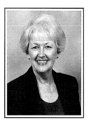
Each Office Is Independently Owned And Operated

Agates, Petrified Wood, Picture Jasper, Thunder Eggs, Obsidian, Geodes, Slabs, and more. Call 749-3157 to arrange for an appointment to preview items desired.