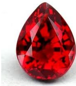
Faceted gem-grade ruby from Thailand

Not only are they born in the same month as our country, but those born in July have the distinction of having the gem corundum Ruby as their birthstone. Ruby is simply the red-colored version of corundum, typically colored by Chromium ions.