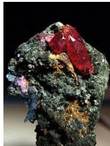
Outstanding Ruby specimen, unknown locale

Ruby is a joy to cut and polish, and behaves much like any other corundum. I have heard many facetors complain of resistance to polishing with corundum, though I haven't experienced this myself. Many of these facetors suggest adding vinegar to your water drip. I do agree that corundum takes longer to polish (it does have a hardness of 9.0, after all...). If you are having problems, I recommend a lap sequence of 260-, 600-, and finally, 3000-grit as a pre-polish. Follow with 100K diamond on your favorite lap (I only use ceramic laps for polishing corundum - another area where I hear other facetors complain that ceramics are "difficult to use". My suggestion is, if it's difficult, start learning early!) Cabbers will want to use full-diamond wheels, final-polishing at 50K or 100K. In my experience, final polish works best on harder surfaces, such as leather, phenol, or wood, though will come up eventually on softer materials.