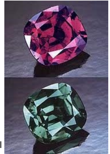
Fine-gem quality faceted Alexandrite showing both indoor (incandescent) and outdoor (full-spectrum) colors.

Chrysoberyl, chemical formula \text{BeAl}_2\text{O}_4 , commonly occurs as orthorhombic crystals, typically tabular parallel to the {001} plane (the basal plane), with striations parallel to the a axis. Twinning on the {130} (rhombic plane) is quite common, and often repeated to form pseudo-hexagonal trillings (often referred to in Chrysoberyl as "sixlings" - the picture of rough crystals below very well demonstrates this behavior, with an easily-seen "sixling" noticeable near the upper-right of the group...) Cleavage is distinct on the {110} plane, and indistinct on {010}. Hardness is an impressive 8.5 on the Moh's scale, making this stone rate third in hardness only after diamond and corundum for typical gems. It is transparent and has a vitreous luster. Color is green to yellowish-green or brownish, and can alternate between green and red, in the case of Alexandrite.