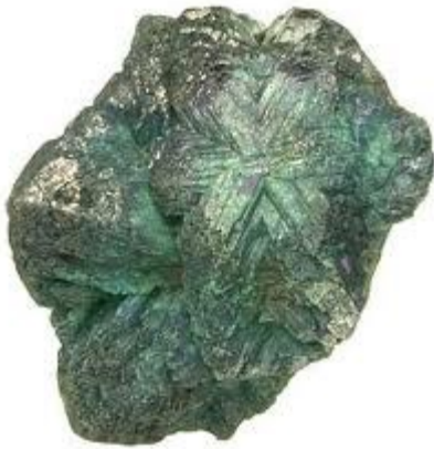
Natural "sixling" Chrysoberyl crystal group with Alexandrite coloration.

Chrysoberyl has a crystal structure very similar to olivine, in which Be replaces the tetrahedrally-coordinated Si, and Al replaces the octahedrally-coordinated Mg. O ions form an almost-hexagonal closest packing of spheres, which explains the pseudo-hexagonal character of Chrysoberyl. Chromium replacing Mg is the chromophore responsible for the ability to change color. In truth, most Chrysoberyl only displays a mild color-shift (perhaps greenish-yellow to brownish-yellow or orangish). Very occasionally, however, the effect is dramatic, with the stone displaying a green or teal color daylight, and a red or purplish-red color in tungsten or incandescent light. These are the only stones that should be truly labeled as Alexandrite. Many chrysoberyl crystals display excellent chatoyance, and are cut by lapidaries as "cat's-eye" stones. This habit is so common and well-presented by chrysoberyl, that most gemologists refer to cat's-eye-Chrysoberyl stones simply as "Cat's-eye".