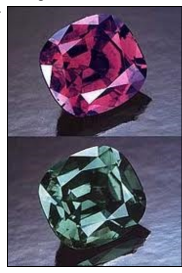
Fine-gem quality faceted Alexandrite showing both indoor (incandescent) and outdoor (full-spectrum) colors.

Chrysoberyl, chemical formula BeAl2O4, commonly occurs as orthorhombic crystals, typically tabular parallel to the {001} plane (the basal plane), with striations parallel to the a axis. Twinning on the {130} (rhombic plane) is quite common, and often repeated to form pseudo-hexagonal trillings (often reffered to in Chrysoberyl as "sixlings" - the picture of rough crystals below very well demonstrates this behavior, with an easily-seen "sixling" noticeable near the upper-right of the group...) Cleavage is distinct on the {110} plane, and indistinct on {010}. Hardness is an impressive 8.5 on the Moh's scale, making this stone rate third in hardness only after diamond and corundum for typical gems. It is transparent and has a vitreous luster. Color is green to yellowish-green or brownish, and can alternate between green and red, in the case of Alexandrite.