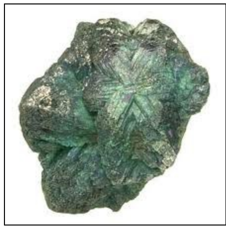
Natural "sixling" Chrysoberyl crystal group with Alexandrite coloration.

the octahedrally-coordinated Mg. O ions form an almost-hexagonal closest packing of spheres, which explains the pseudo-hexagonal character of Chrysoberyl. Chromium replacing Mg is the chromophore responsible for the ability to change color. In truth, most Chrysoberyl only displays