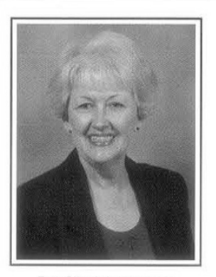
Each Office Is Independently Owned And Operated

Please contact one of the following individuals if you are interested in donating materials (rocks, equipment, etc.) to the Old Pueblo Lapidary Club: Art Kavan 297-8798 or Bill Carmody 760-8598