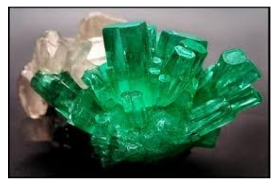
Outstanding Emerald on Calcite Cabinet Specimen

Most beryl is found in granitic pegmatites, but emerald is an exception - it most frequently occurs in mica-schists, or veins and cavities in bituminous limestone (like the famous emerald mines of Muzo, Columbia.)