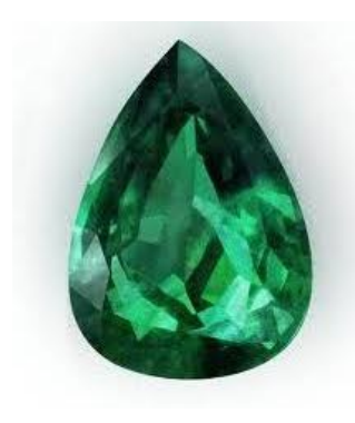
6.84 Carat Fine Gem Emerald From the Author's Collection

May's birthstone is the fabulous variety of Beryl known as Emerald . Beryl forms commonly as simple, prismatic, hexagonal crystals, whose prism faces are often vertically striated or grooved. It has indistinct cleavage on the basal {0001} plane, and conchoidal or uneven fracture. Hardness varies from 7.5 - 8.0 on the Moh's Scale, with relatively fragile emerald usually coming in closer to 7.5. It has a density of roughly 2.7. It has a vitreous luster, is transparent to translucent, and large crystals can vary in transparency. This is especially true with emerald, whose formation happens in such violently magmatic conditions as to virtually assure a variety of inclusions (emeralds are known for their Jardin , a French word for "Garden"- the mass of inclusions leaves the impression of a