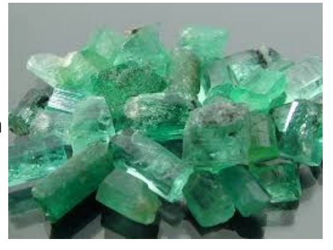
Emerald Rough from Muzo, Columbia

that lie on top of each other and thus form endless channels along the c -axis of the crystal. The rings are linked by [BeO4] tetrahedra and [AlO6] octahedral. In addition to the main elements of beryl, minor amounts of Li, Na, or other alkyloid metals can be present (like H2O or CO2, they can be accommodated in the channels.) Color is caused by chromophores in the form of transition elements, and typically, Chromium (as Cr3+) is responsible for the deep-green in emerald. Vanadium may also act as a chromophore, either by itself, or in concert with the Chromium. Though Iron may color beryl green, it is not consid-