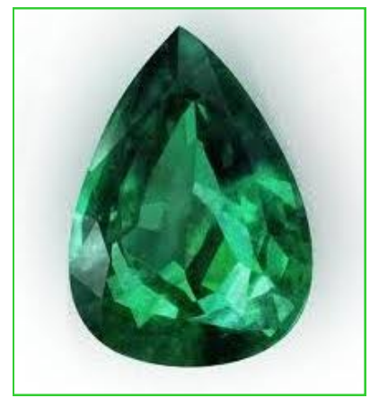
6.84 Carat Fine Gem Emerald From the Author's Collection

May's birthstone is the fabulous variety of Beryl known as Emerald . Beryl forms commonly as simple, prismatic, hexagonal crystals, whose prism faces are often vertically striated or grooved. It has indistinct cleavage on the basal {0001} plane, and conchoidal or uneven fracture. Hardness varies from 7.5 - 8.0 on the Moh's Scale, with relatively-fragile emerald usually coming in closer to 7.5. It has a density of roughly 2.7. It has a vitreous luster, is transparent to translucent, and large crystals can vary in transparency. This is especially true with emerald, whose formation happens in such violently magmatic conditions as to virtually assure a variety of inclusions (emeralds are known for their Jardin , a French word for "Garden"- the mass of inclusions leaves the impression of a painted garden landscape…)