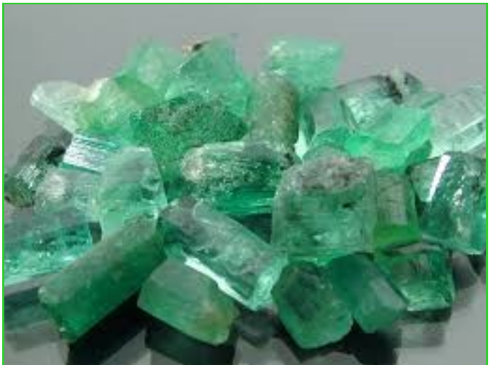
Emerald Rough from Muzo, Columbia

plained for Aquamarine (another form of beryl) in the March issue, the crystal structure of beryl is characterized by sixfold rings of [SiO4] tetrahedra that lie on top of each other and thus form endless channels along the c -axis of the crystal. The rings are linked by [BeO4] tetrahedra and [AlO6] octahedral. In addition to the main elements of beryl, minor amounts of Li, Na, or other alkyloid metals can be present (like H2O or CO2, they can be accommodated in the channels.) Color is caused by chromophores in the form of transition elements, and typically, Chromium (as Cr3+) is responsible for the deepgreen in emerald. Vanadium may also act as a chromophore, either by itself, or in concert with the