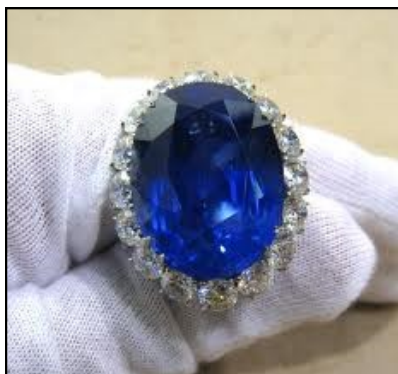
Top-Quality Faceted Sapphire surrounded by diamonds in platinum ring

Australia, among others. We have gem occurrences in the United States in North Carolina and Montana. The most famous sapphire deposits, though long mined-out, occurred at high altitude at Padar in Kashmir, India, where marble and other metamorphic rocks are cut by pegmatitic dykes. New sources are found often, especially in Africa, but a very recent find in Ceylon, Sri Lanka, shows amazing promise with deep-blue transparent crystals that can weigh over 20 grams! Sapphire is fairly easy to cut and polish, though beginners sometimes have trouble with pre-polish. Try using a 8,000-grit diamond on zinc lap, followed by 50K on zinc, with 3/4 to full speed. You will probably never cut another stone with such sharp facet breaks (unless you are a diamond brillianteer!)