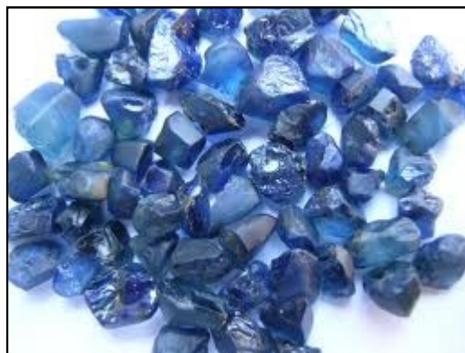
African Sapphire Rough

a few parts per million! Crystal structure can be described as an almost-hexagonal close packing of spheres of O atoms in which two-thirds of the octohedrally-coordinated interstices are occupied by Al and the remaining third are empty. Corundum occurs in silicon-poor igneous rocks such as syenites and nepheline-syenites and associated pegmatites, in contact zones between peridotites and surrounding rocks, and in metamorphic rocks such as gneisses, mica-schists, and crystalline limestones. Because of its hardness and chemical resistance, it is also widespread in sand and gravel deposits.