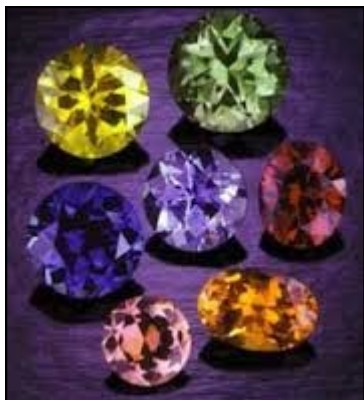
Fine Faceted Sapphires in various colors

Sapphire is the gemstone for September, and the common name for gem-grade Corundum (technically, Ruby is another name for gem-grade corundum, but only for those rare red crystals with chromium as the chromophore, or coloring agent...) Corundum is an oxide of Aluminum that occurs as trigonal crystals (typically barrel-shaped with several steep hexagonal bipyramids, tabular bipyramids, usually lamellar, and sometimes granular). It has vitreous luster and is translucent to transparent. It has no cleavage, a Moh's hardness of approximately 9.0, and a density of approximately 4.0. Color is usually grey, weakly blue, yellow, or red, but all colors can occur. Normally pure Al_2O_3 , the color-giving ions, such as Cr (ruby) or Fe and Ti (sapphire), are present only in very small amounts - typically only