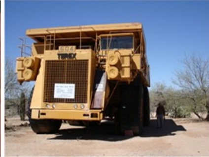
Asarco Mission Mine