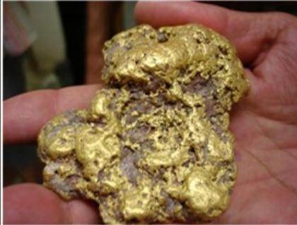
Gold specimen ASDM