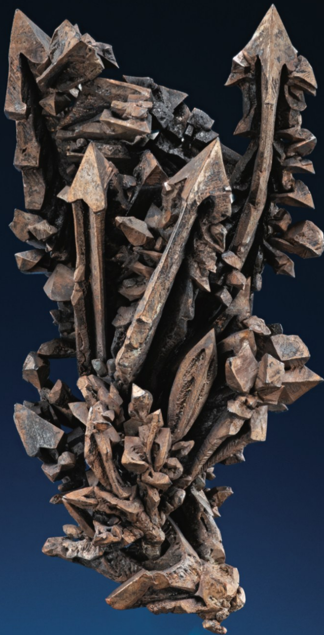
COPPER Phoenix Mine, Keweenaw County, Michigan, USA 5.3cm - Steve Smale Collection